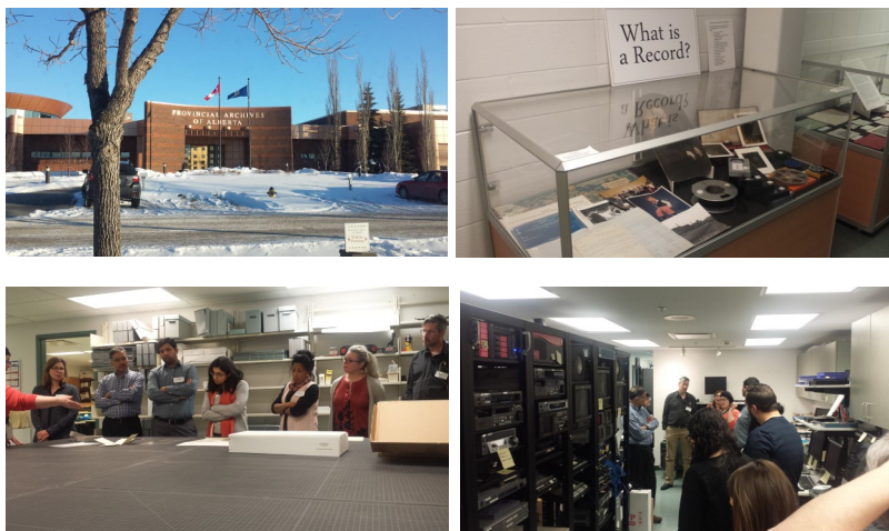
Images from the Provincial Archives of Alberta tours.