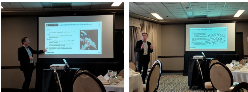
Images from the Blockchain presentation.